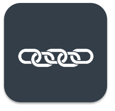
Supply Chain Optimization